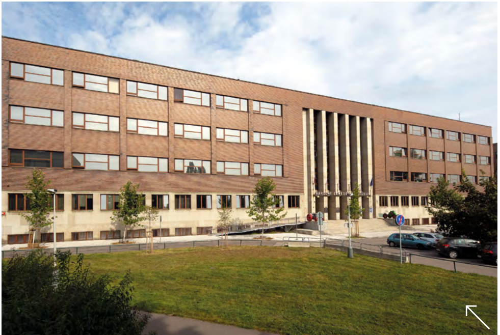
National Museum of Agriculture