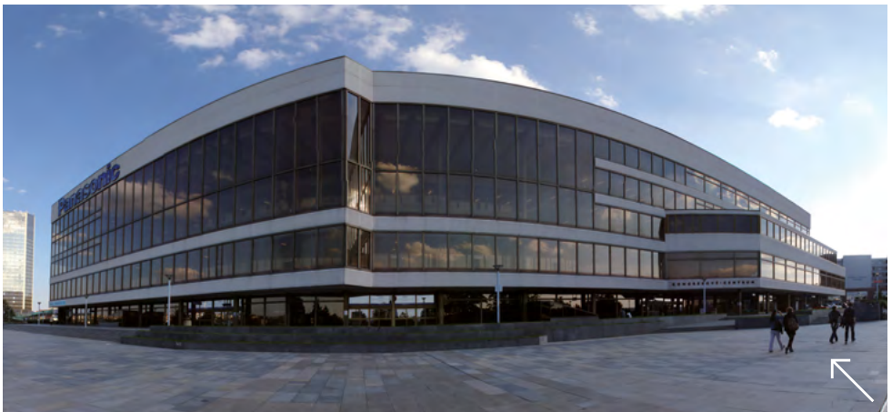
Prague Congress Centre

Conference participants will pay a registration fee of a basic amount of 350 EUR for onsite and 150 EUR for remote attendance.